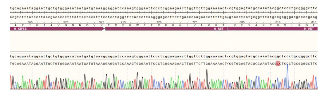
Figure 2 | The KIF5B-RET mutation analysis by Sanger sequencing.

Toll-free: +86 400 627 9288 Email: service@genomeditech.com